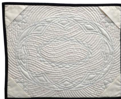
View of back of artwork